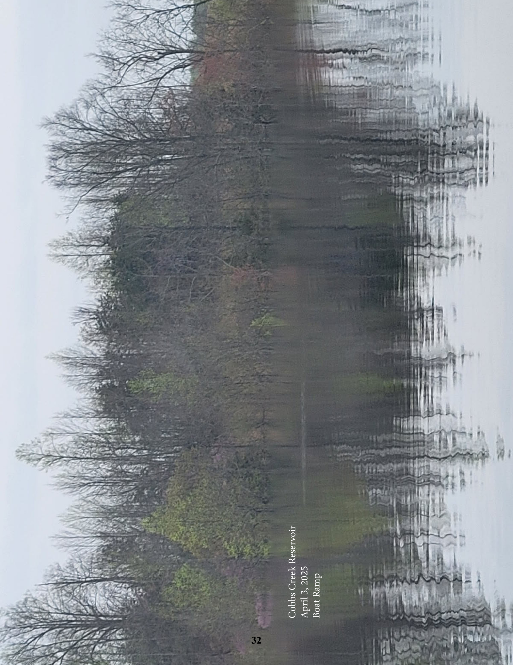
Cobbs Creek Reservoir April 3, 2025 Boat Ramp